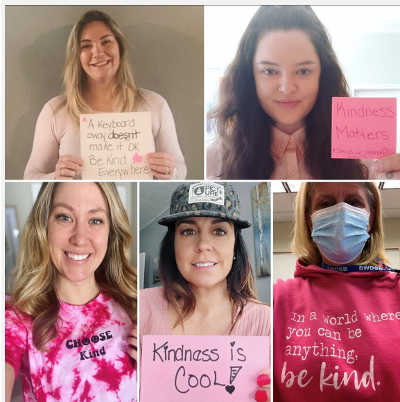
Staff members from Bluewater District School Board's Mental Health Team share a message of kindness during Pink Shirt Day 2022. The team is always available to support students and works hard to destigmatize issues surrounding mental health.

Students and staff in Bluewater District School Board honoured a popular annual tradition on February 23, 2022 with the celebration of Pink Shirt Day. This year's theme of "Lift Each Other Up" provided an opportunity for participants to sport their most vibrant pink clothing fashions, adorn classrooms and hallways with pink art and positive messaging, and organize a variety of activities aimed at raising anti-bullying awareness and promoting accepting and inclusive learning environments. Pink Shirt Day is one of several initiatives held throughout the year in Bluewater District School Board to actualize our strategic priority of ensuring a safe supportive learning community that works together to support wellness, and fosters the strengths, contributions, and overall health of students and staff.